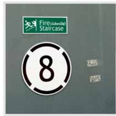
Fire exit, Bangkok, Thailand