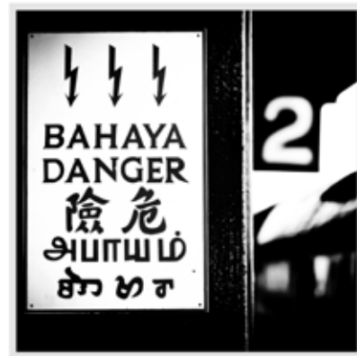
Platform 2, Malaysia