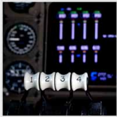
Cockpit A-380, Germany