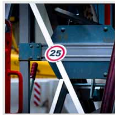
Lifting platform, Leipzig, Germany