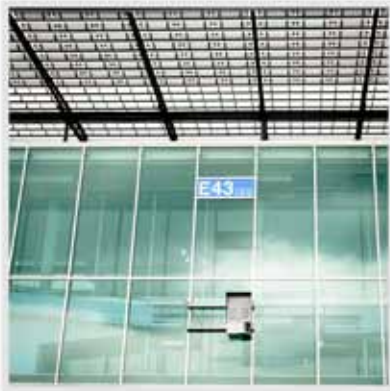
Gate E43, Airport Frankfurt, Germany