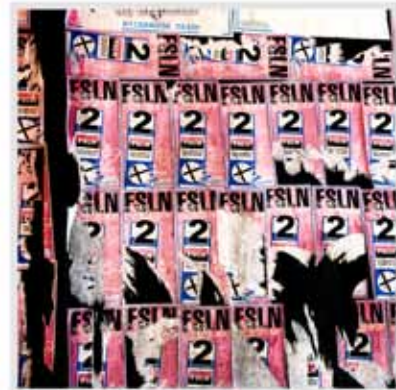
Election poster, Nicaragua