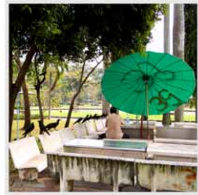
Park in Bangkok, Thailand