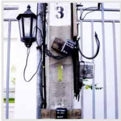
Financial District, Bangkok, Thailand