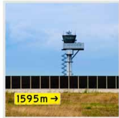
Runway, Leipzig, Germany