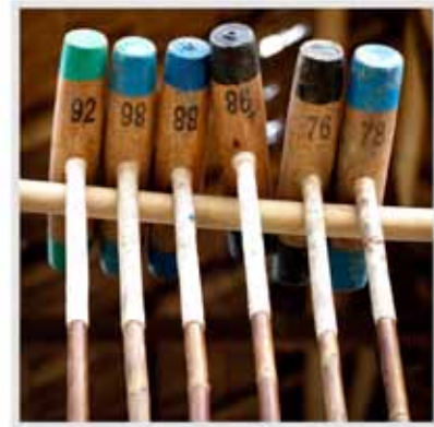
Elephant-Polo Mallet, Chiang Sean, Thailand