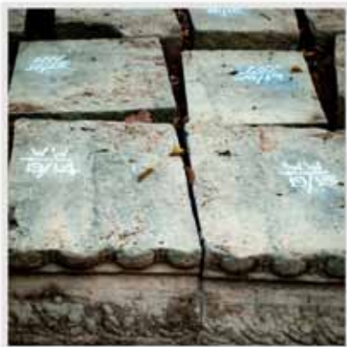
Reconstruction, Angkor Wat, Cambodia