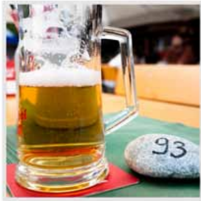
Mountain rest, Rauris, Austria