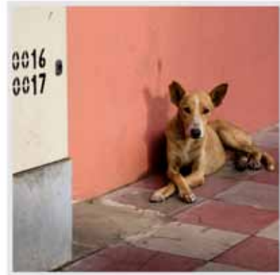
Street dog, Granada, Nicaragua