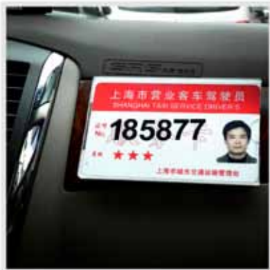
Taxi driver 185877, Shanghai