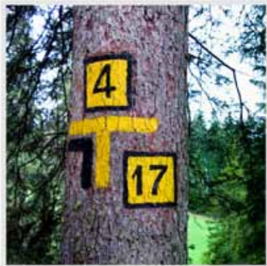
Trail route 4 & 17, South Tyrol, Italy