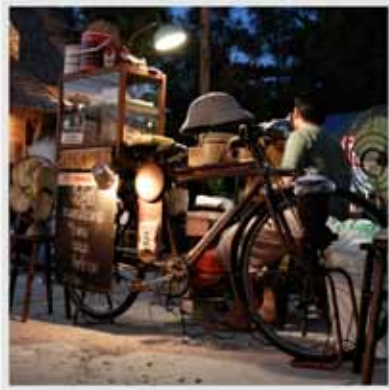
Flea market, Bangkok, Thailand