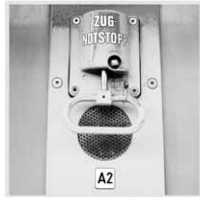
Emergency stop, Vienna, Austria