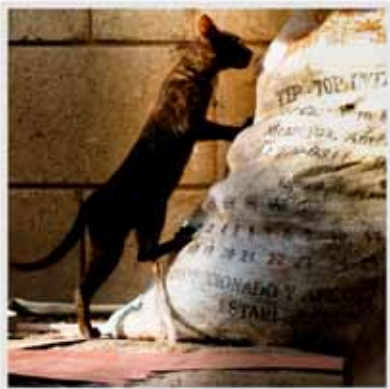
Cat climbing on potato sack, Nicaragua