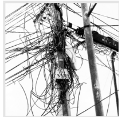
Power pole, Guatemala