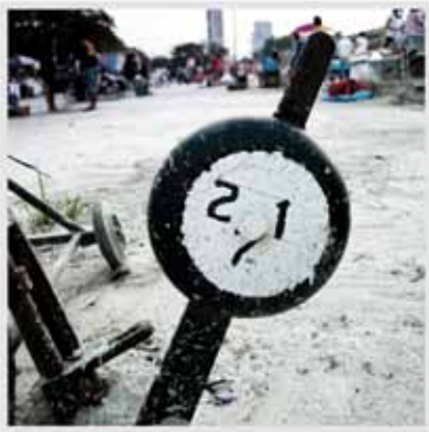
Abandoned train station, Thailand