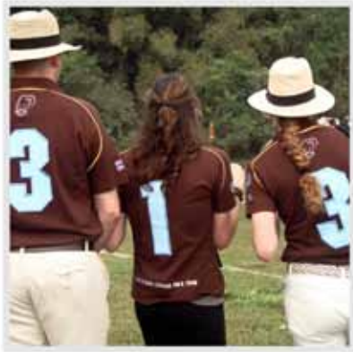
Elephant Polo, North Thailand