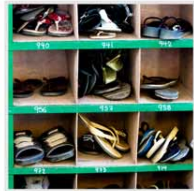
Pandaya Temple, Myanmar