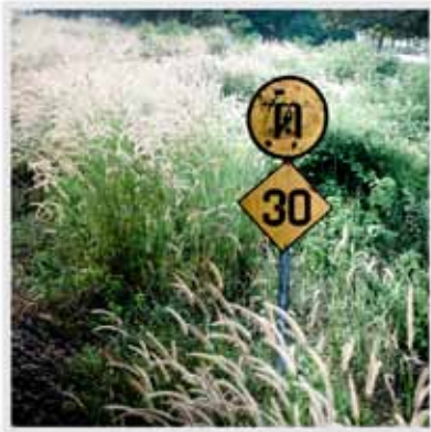
Railway line to River Kwai, Thailand