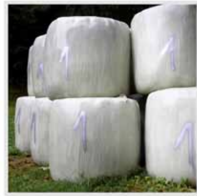
Hay bales, Salzburg, Austria