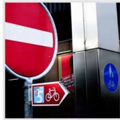
Bike path 5, Zürich, Switzerland