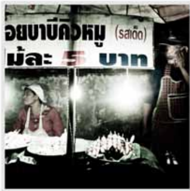
Night market, Chiang Mai, Thailand