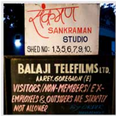
Film Studios, Mumbai, India