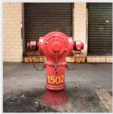
Hydrant 1502, Hong Kong