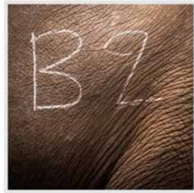
Polo Elephant, Chiang Sean, Thailand