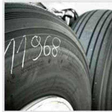
A-380 Aeroplane tire, Leipzig, Germany