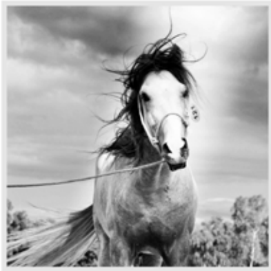
Horse show, Nicaragua