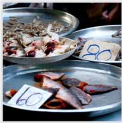
Frog legs, Thailand