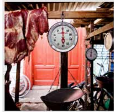
Meat scale, Granada, Nicaragua