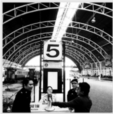
Platform 5, Bangkok, Thailand