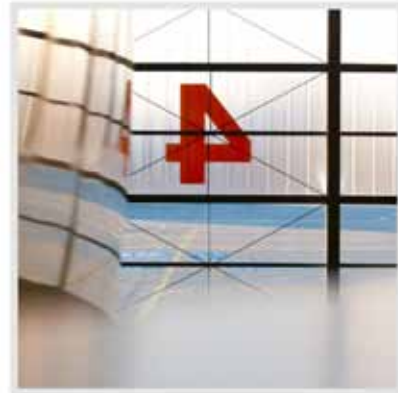
Airplane hangar, Frankfurt, Germany