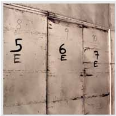
Market, Granada, Nicaragua