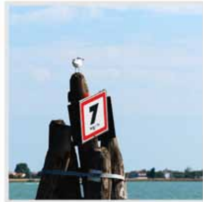
Speed limit, Venice, Italy