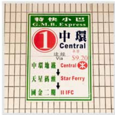
Bus Station, Hong Kong