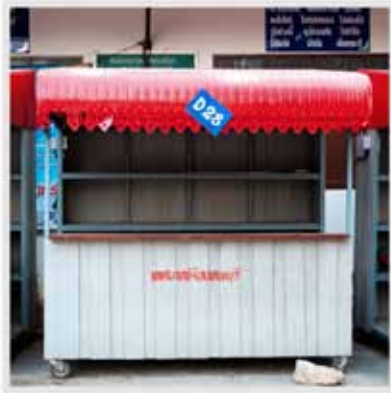
Stand D28, Cambodia