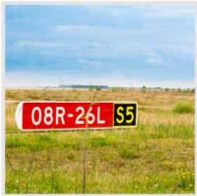
Runway, Leipzig, Germany