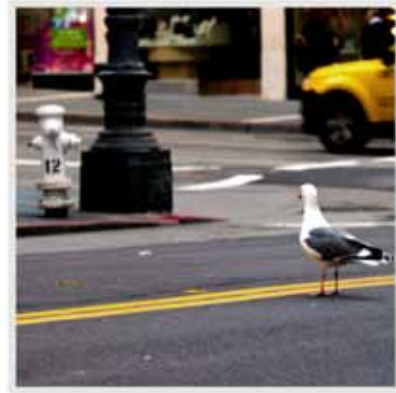
Hydrant 12, San Francisco, USA